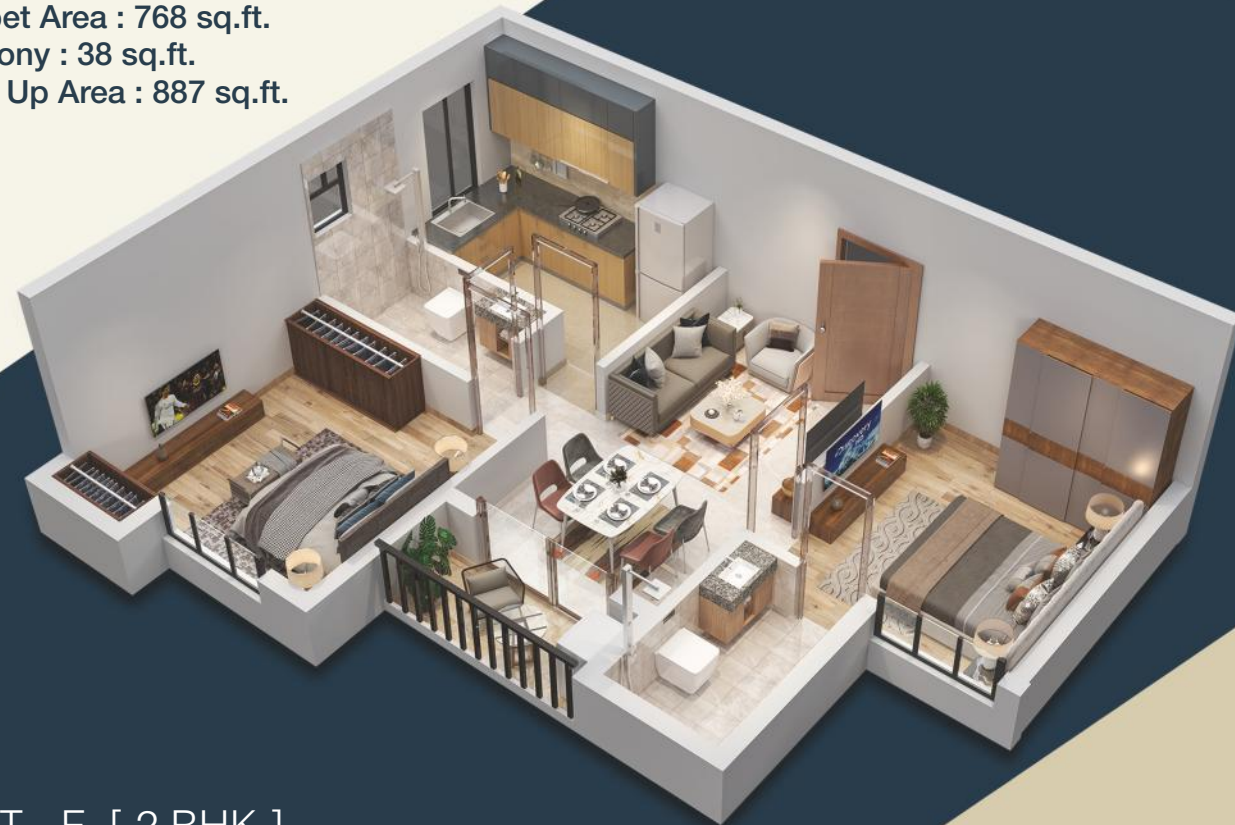
FLAT - F [ 2 BHK ]

Carpet Area : 539 sq.ft. Balcony : 27 sq.ft. Built Up Area : 640 sq.ft.