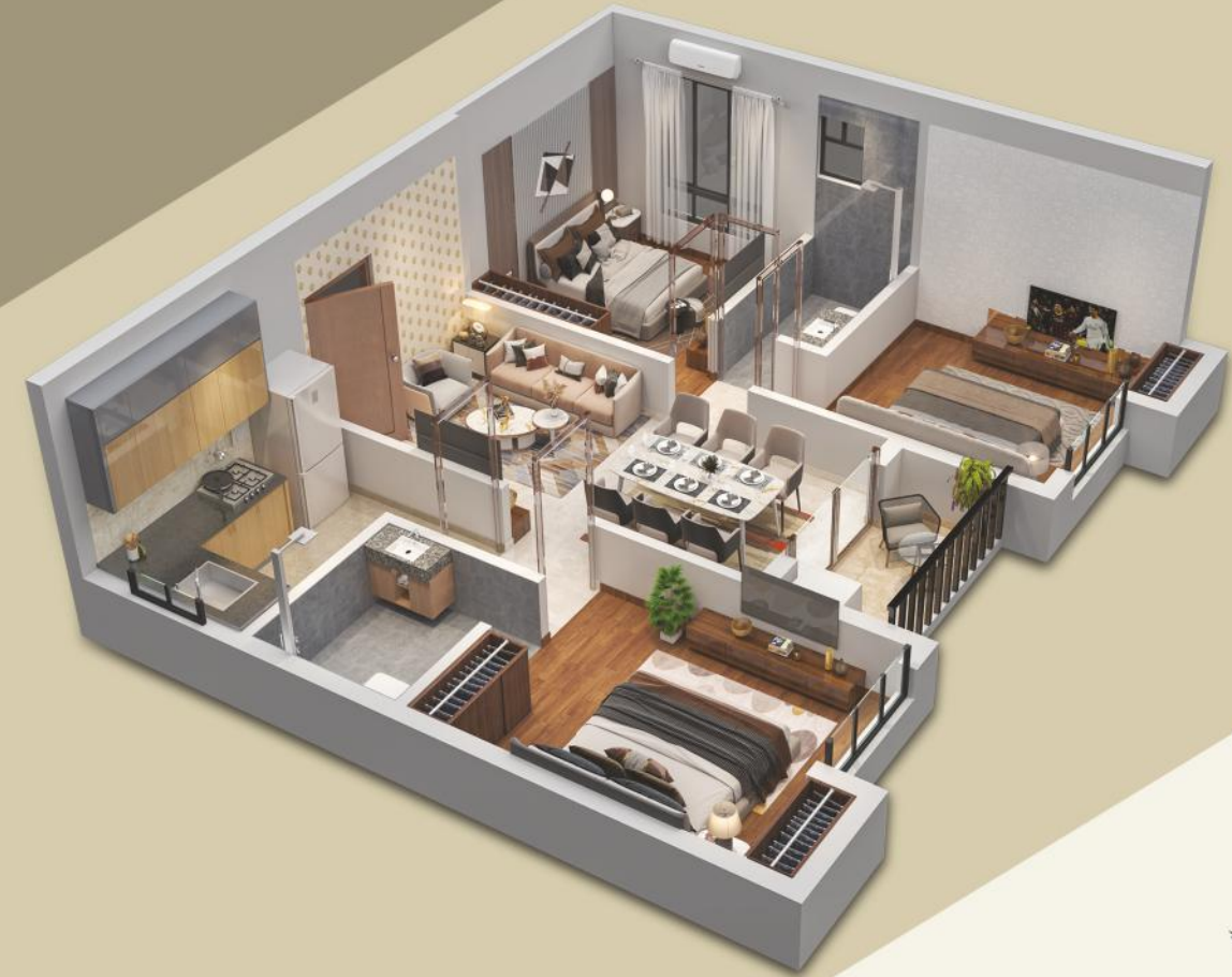
FLAT - C [ 3 BHK ] Carpet Area : 663 sq.ft. Balcony : 33 sq.ft. Built Up Area : 777 sq.ft.