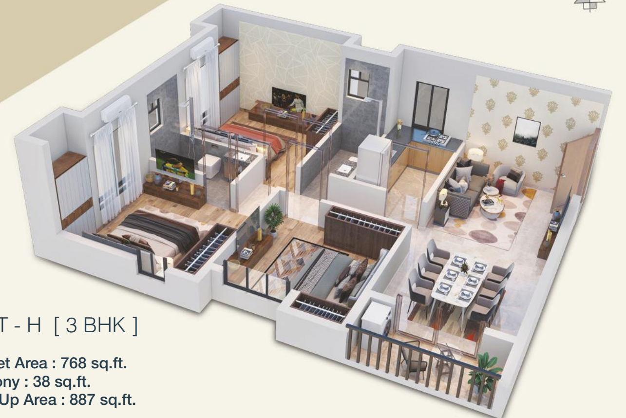
FLAT - H [ 3 BHK ]

Carpet Area : 768 sq.ft. Balcony : 38 sq.ft. Built Up Area : 887 sq.ft.