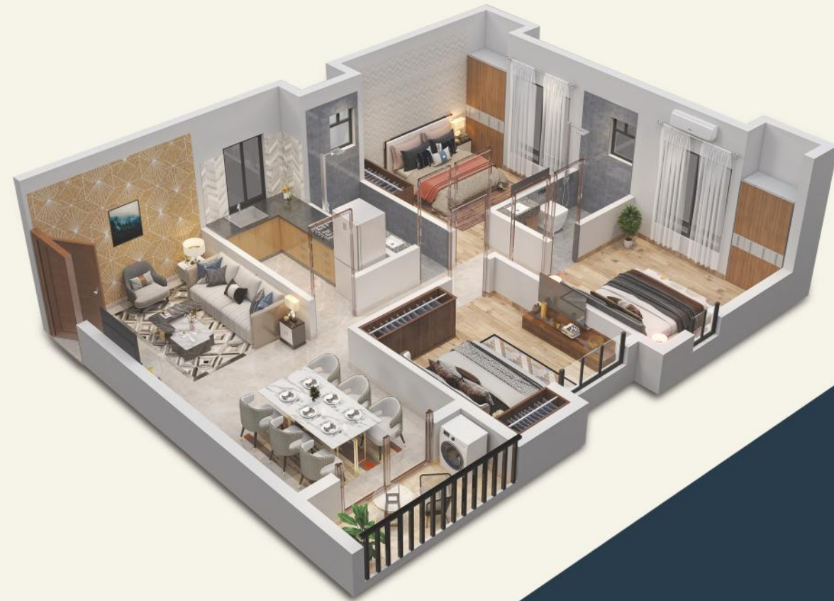
FLAT - E [ 3 BHK ]

Carpet Area : 768 sq.ft. Balcony : 38 sq.ft. Built Up Area : 887 sq.ft.