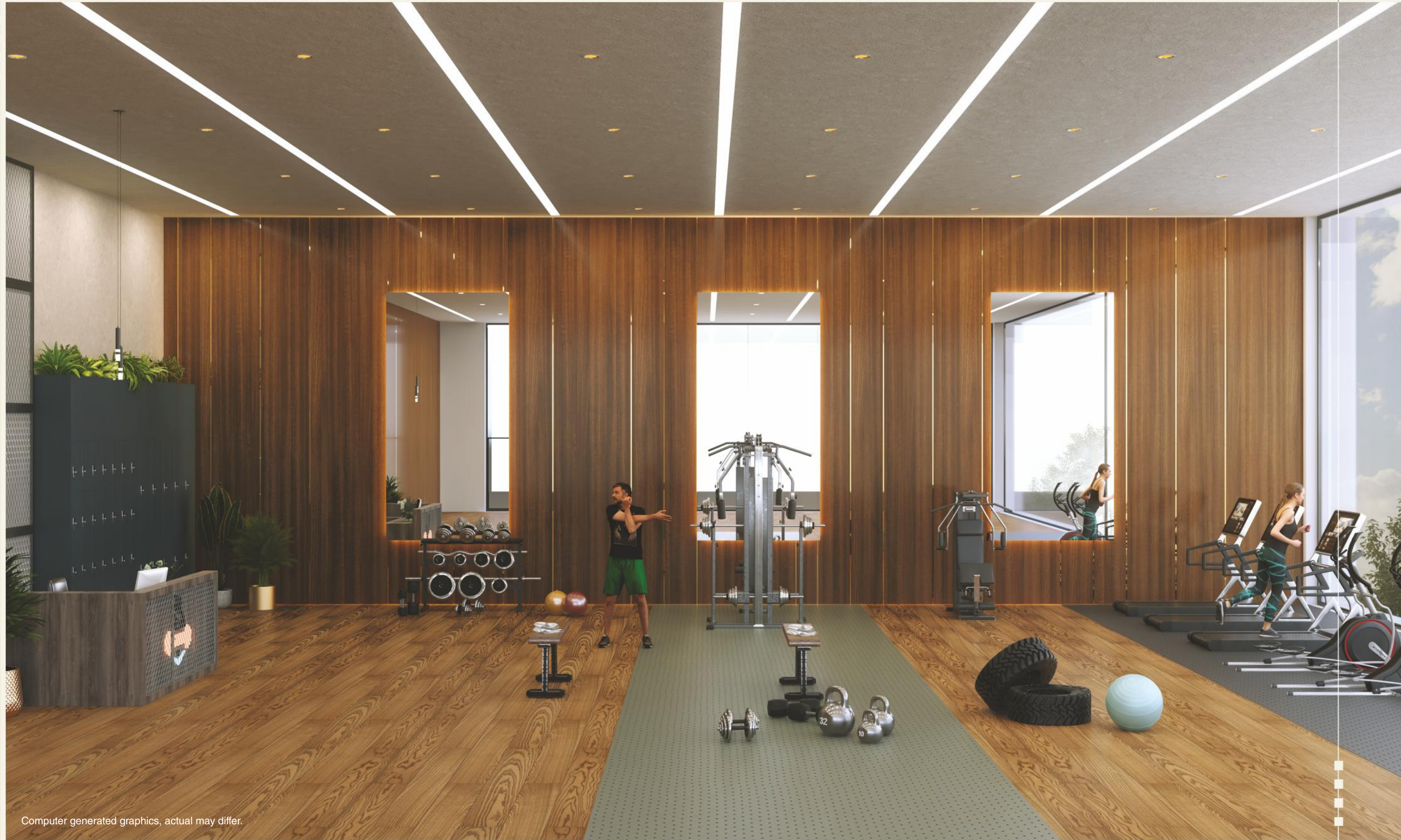
Computer generated graphics, actual may differ.