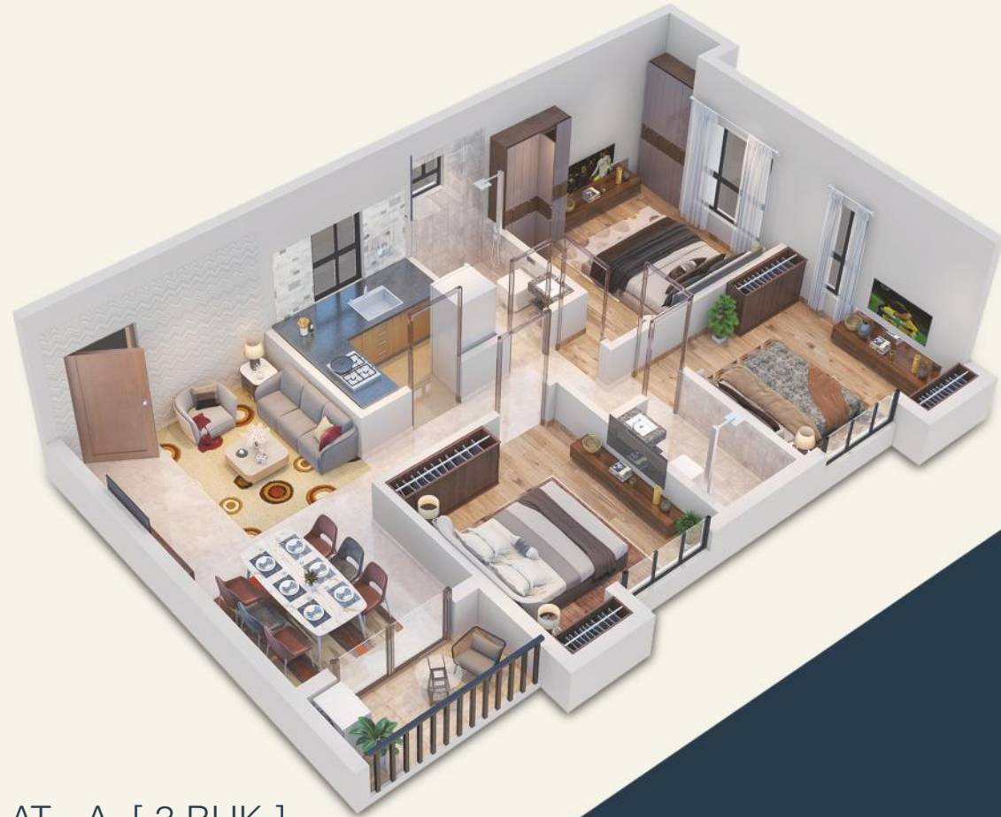
FLAT - A [ 3 BHK ] Carpet Area : 713 sq.ft. Balcony : 34 sq.ft. Built Up Area : 823 sq.ft.