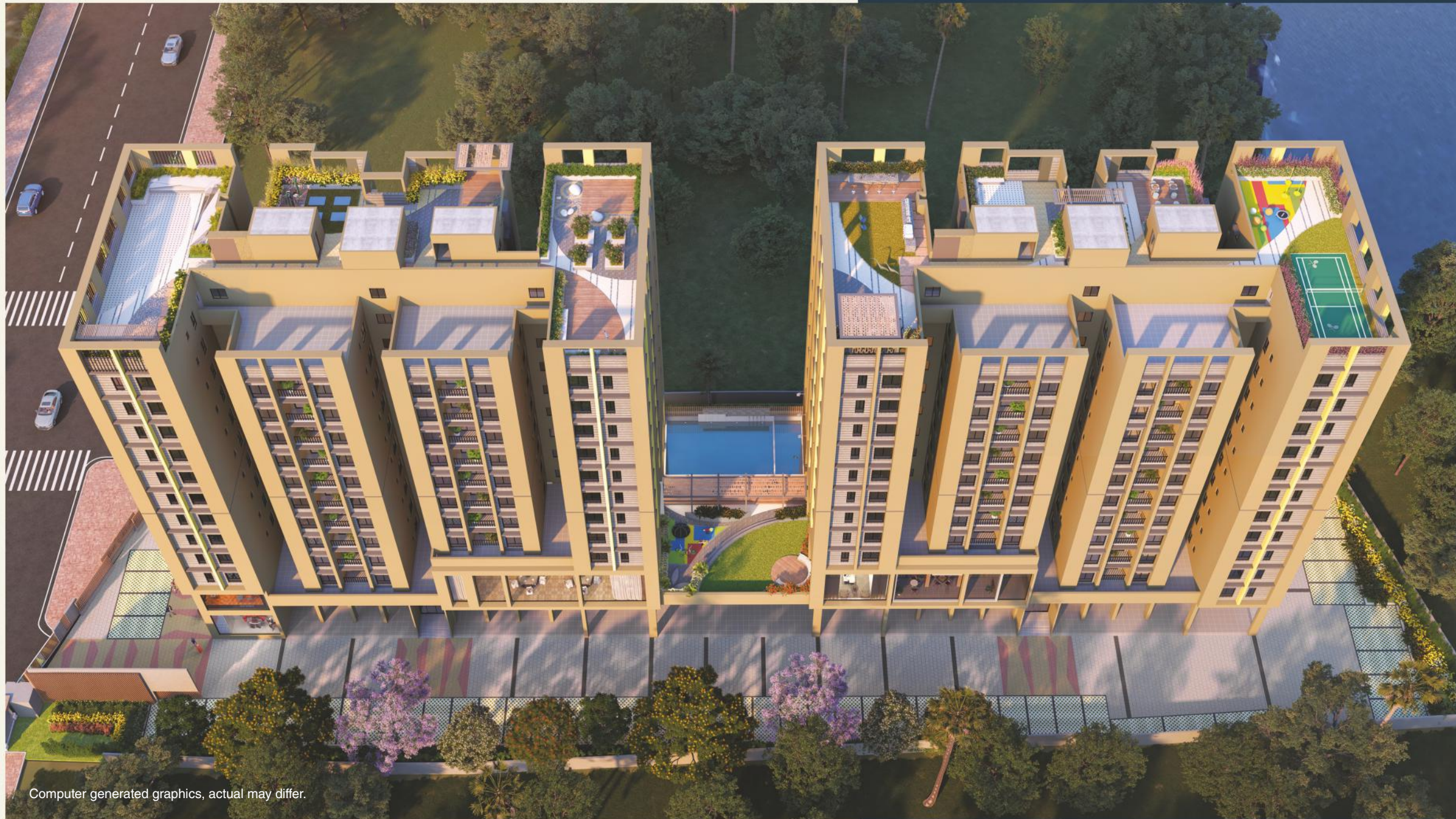
Computer generated graphics, actual may differ.

Whether its 2 or 3 bedroom home luxury comes guaranteed. Contemporary, light, open spaces, where every details has been considered to create your dream home.