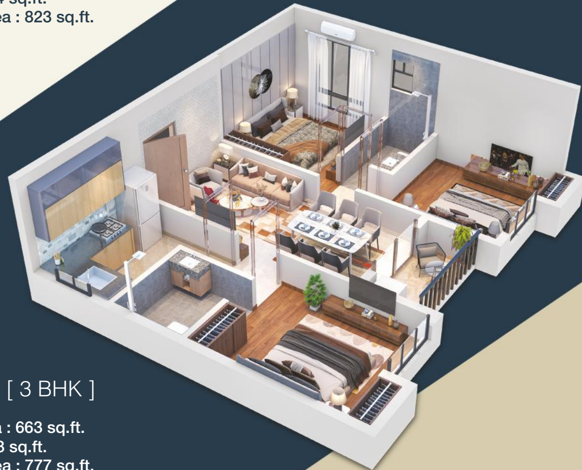
FLAT - B [ 3 BHK ] Carpet Area : 663 sq.ft. Balcony : 33 sq.ft. Built Up Area : 777 sq.ft.