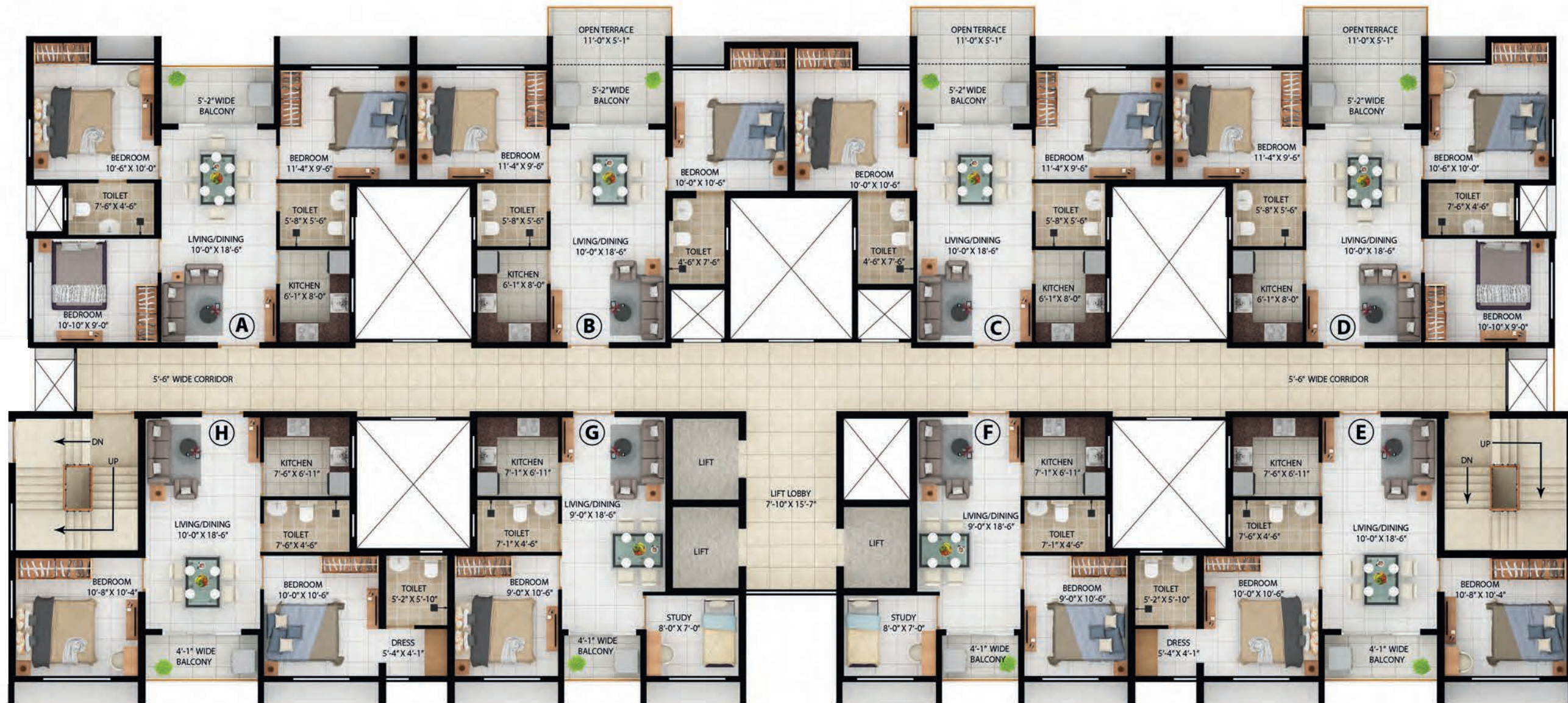
REEF (BLOCK 3C) | Typical floor plan (4th, 7th & 10th Floor Plan)