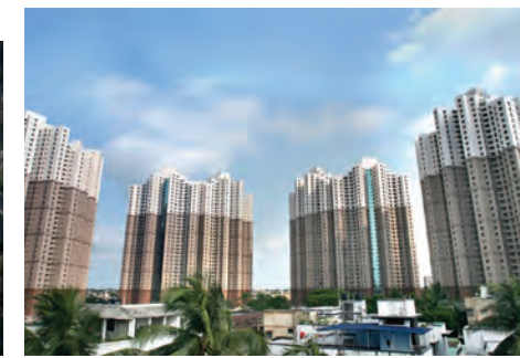
South City Residence | Kolkata