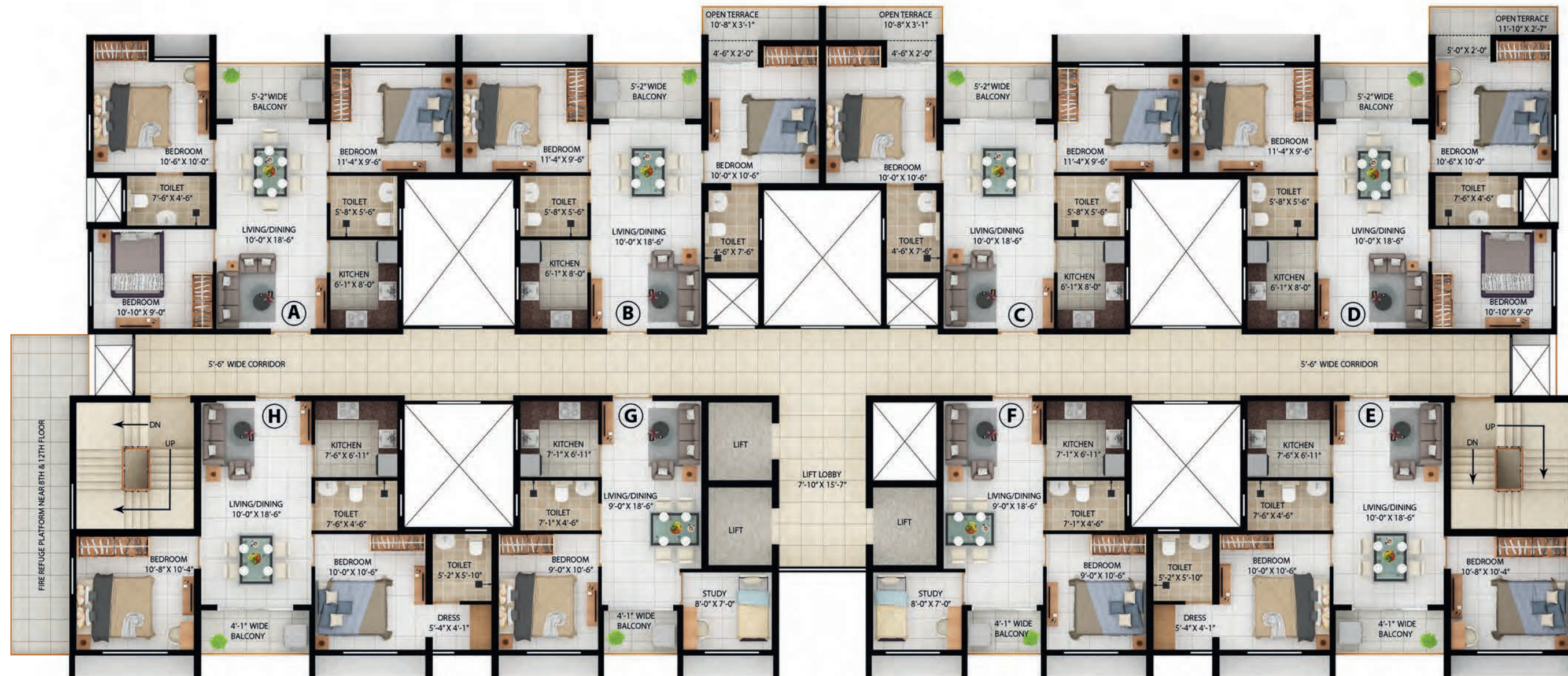
REEF (BLOCK 3C) | Typical floor plan (3rd, 6th, 9th & 12th Floor Plan)