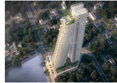
Altair | Colombo, Sri Lanka