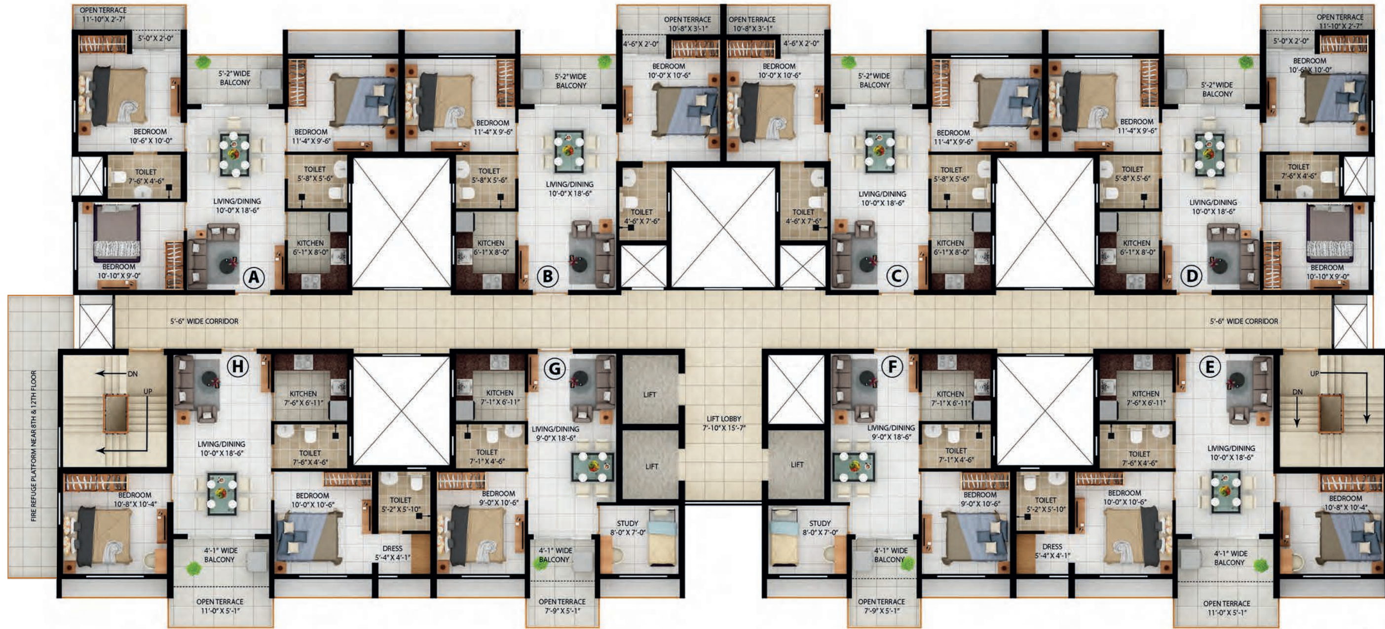
RAYAN (BLOCK 3A) | Typical floor plan (5th, 8th & 11th Floor Plan)