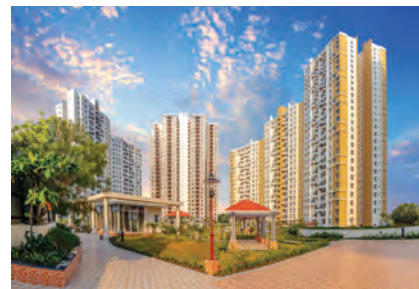
Elita Garden Vista | New Town, Kolkata