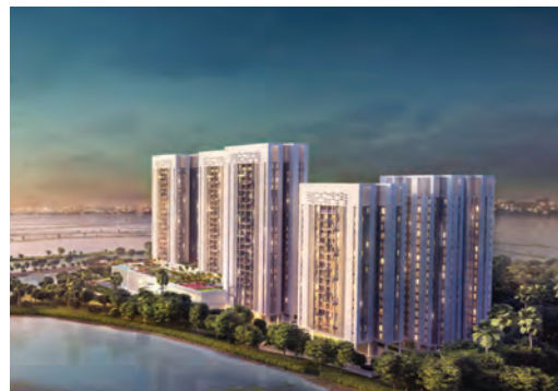
Fifth Avenue | Sector-V, Salt Lake