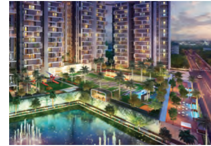
The One | Tollygunje, Kolkata