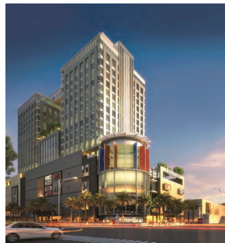
Acropolis Mall | Kolkata