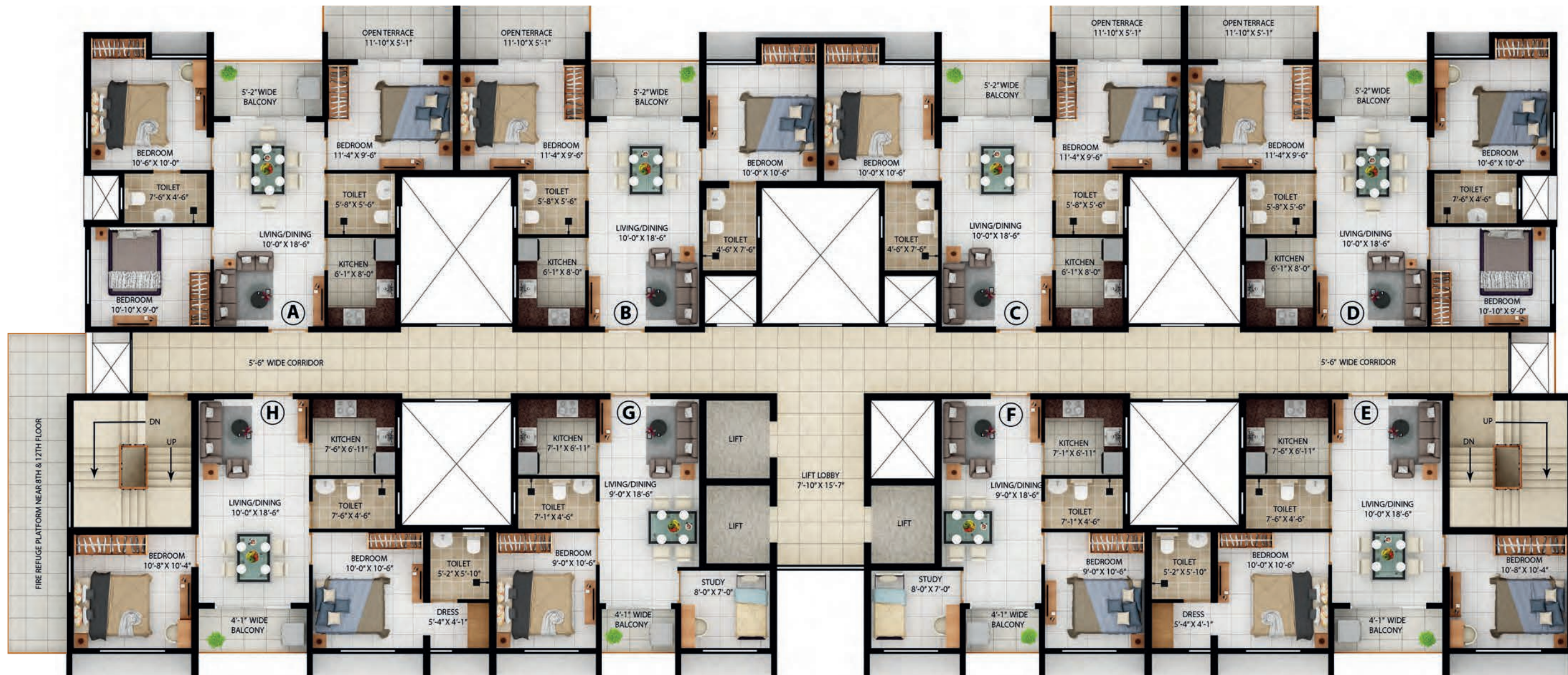
RILLA (BLOCK 3D) | Typical floor plan (2nd, 5th, 8th & 11th Floor Plan)